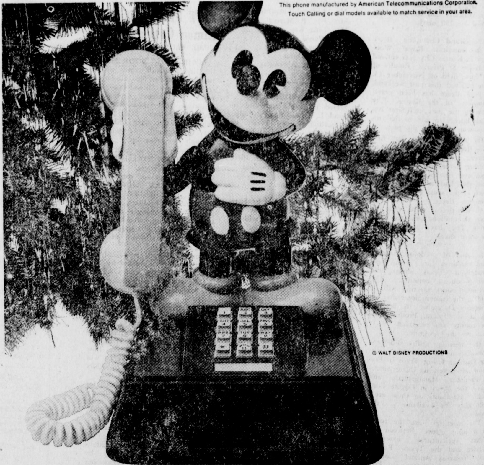
This phone manufactured by American Telecommunications Corporation. Touch Calling or dial models available to match service in your area.