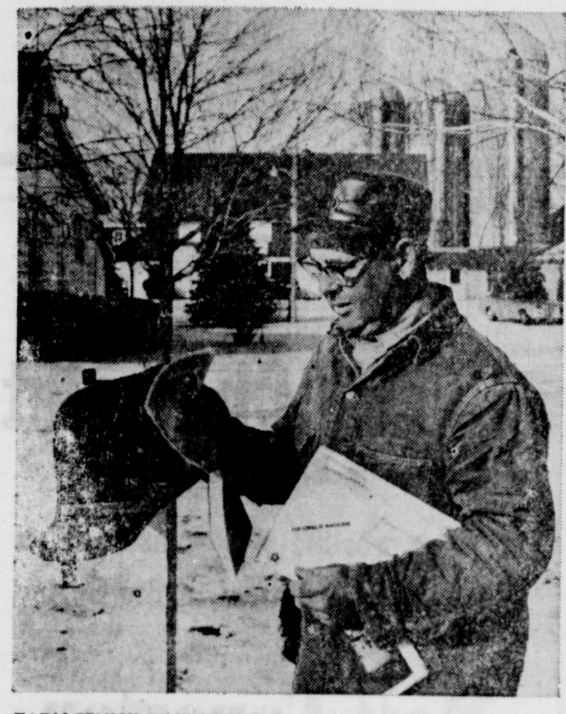
FARM CENSUS TIME AGAIN-Farmers and ranchers throughout the United States are being asked to report on their agricultural operations during 1974. The 1974 Census of Agriculture is the 20th nationwide farm census since the first one in 1840. Report forms are mailed out in January and the Bureau of the Census would like to have them filled out and mailed back promptly. All information is confidential by law. The results, published only in statistical form, provide the yardstick by which American agricultural advancement is measured every five years. No information can be released which might reveal the operation of an individual farmer or rancher.