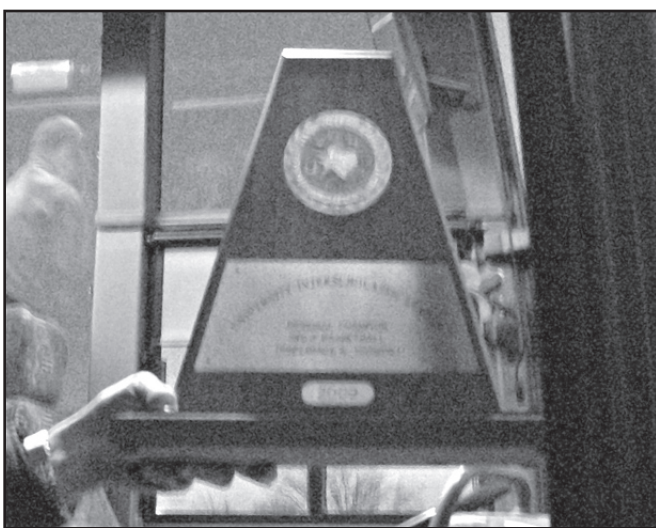
Sudan's ladies brought back the trophy from their win over Canadian on Saturday.