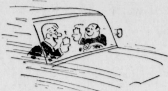
"Here's looking at you, Ed!"