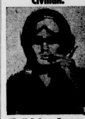
The U.S. Army Reserve.

A golden opportunity in law enforcement awaits qualified young men. Get in touch with your Texas Department of Public Safety office or patrolman.