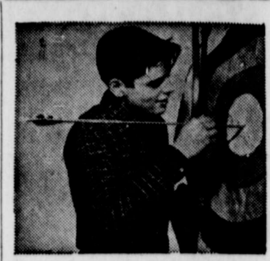
Young people need help in