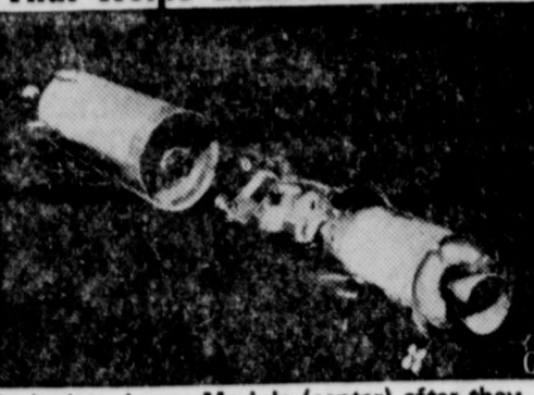
locked to Lunar Module (center) after they had been gently pushed away from the booster (left). Singer provides equipment and services for almost all stages of the Apollo missions.

A battery of 50 searchlights flood the Apollo launch site with light of the proper intensity and reliability for filming of the blast-off (left). Artist's conception shows Apollo Command/Service Module (right)