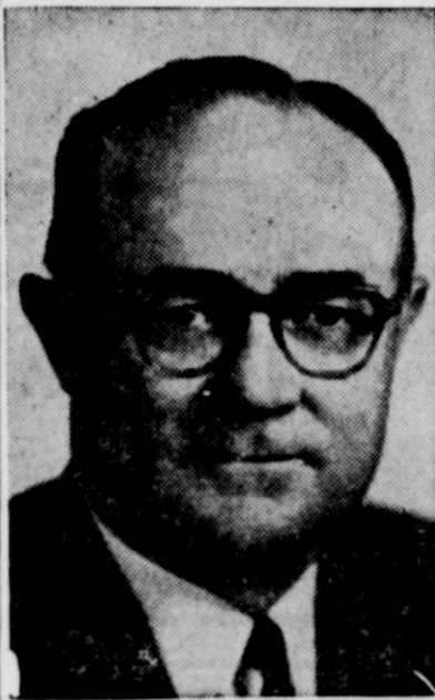
PRESTON SMITH ELECTED GOVERNOR Preston Smith was elected governor of Texas, getting the statewide majority over Republican Paul Eggers.