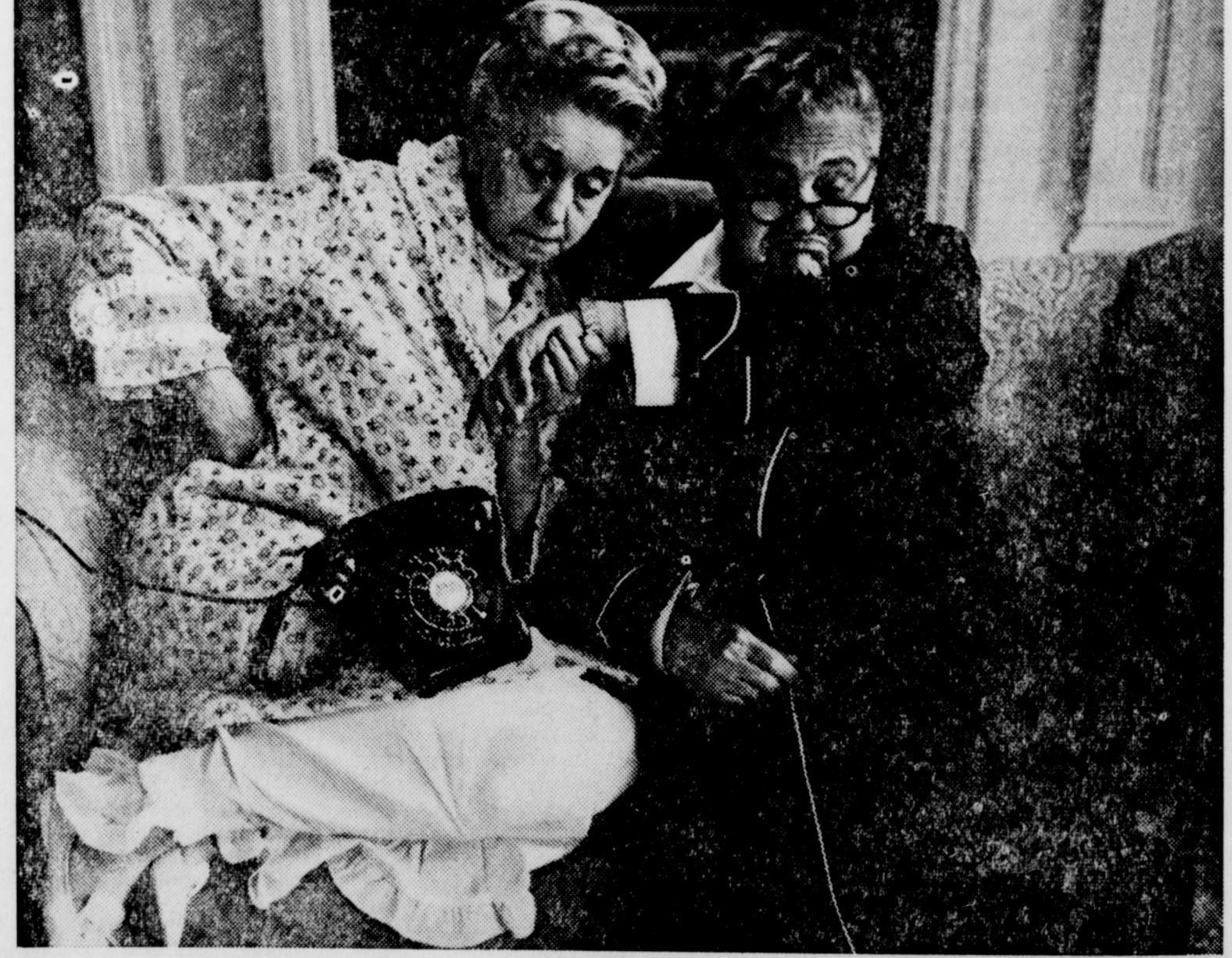
After 7 p.m., you can call anywhere in the country for a dollar.

All long distance callers worth their salt know that calling in the daytime is more expensive than calling in the evening hours. (Actually, most people call during the day, when we charge our regular rates.)