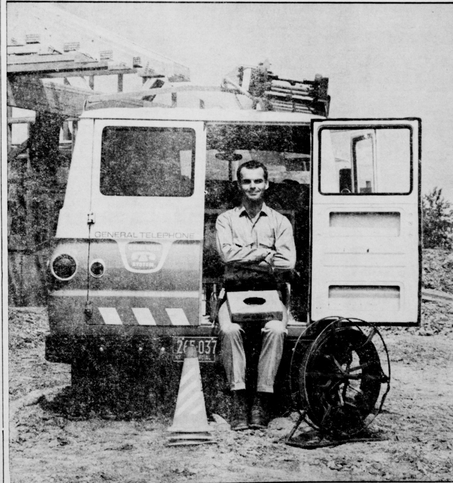
One of our busiest offices.