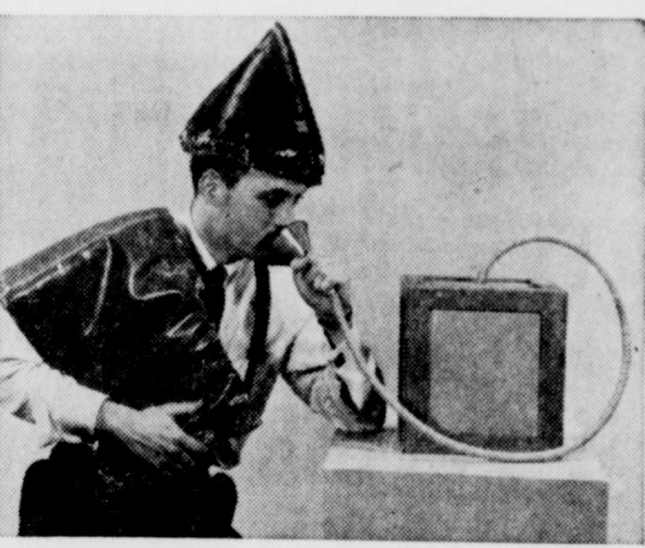
Cap, cape and empty box were supposed to supply "orgone energy" with which a person could cure himself of many afflictions. No such energy exists, but thousands were deluded before this myth was exposed.

Another "practitioner," who came here from India, advertised that he has at least 15 degrees, including an "honorary M.D." He started the Spectro-Chrome Institute about 1920 and did a (he was 75). He was put on five flourishing business until the year's probation. However, when