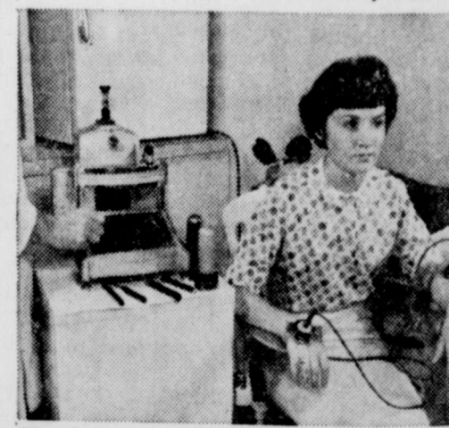
Micro-dynameter, which sold to chiropractors for as much as $875 each, was billed as a device for diagnosing patients ills. Actually, the only thing the device was capable of measuring was the moisture of the skin. Federal courts ordered it off the market.

government prosecuted him in the term ended he was reported and a very poor chance to re-1947 for repeated violation of the federal food and drug law. At the trial it came out that the founder of the institute had told an elderly diabetic to stop taking insulin-that Spectro-Chrome was all he needed. The diabetic took the advice, and soon afterward went into a coma and died. Also at the trial an epileptic, testifying that the same device had benefited him, collapsed on the witness stand-from an epi-