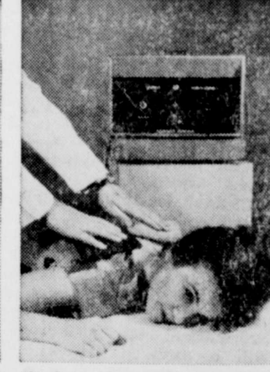
This device was supposed to cure cancer by playing silently a recording of "Smoke Gets in Your Eyes." Units sold for up to $500.