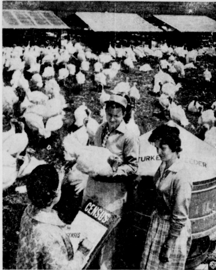
Census takers will visit every farm and ranch in the United States during November or December as part of the 1964 Census of Agriculture, conducted by the U.S. Bureau of the Census. Census questionnaires will be delivered by mail; the farmer will answer the questions and keep the questionnaire until the census taker calls for it. Answers are confidential and are used only for statistics. From the last Census of Agriculture in 1959 the nation learned that the number of farms had dropped by about 1 million in five years, but farm production had increased.