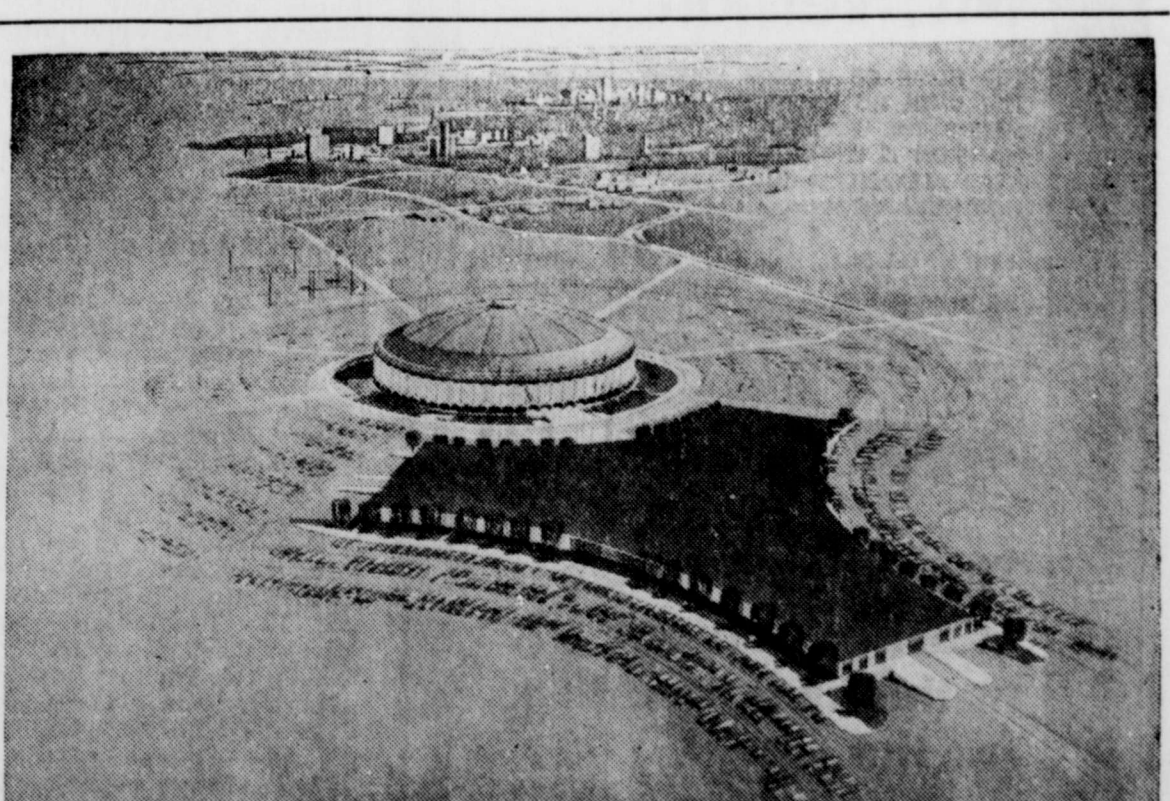
HOME OF HOUSTON LIVESTOCK SHOW AND RODEO-The largest livestock exhibition building under one roof in the world will be the home of the Houston Livestock Show beginning in 1966. The air-conditioned building covers 12 acres and will have stalls to accommodate 1700 halter cattle, 600 horses, 1200 swine, 1200 sheep and goats, and a 208' x 80' livestock judging arena. It will provide separate sheep and swine arenas, an auction arena for breed sales and commercial cattle, facilities for poultry and rabbits and a milking parlor with observation facilities. The exhibition building is adjacent to the famed Domed Stadium which will house America's largest and wildest rodeo.