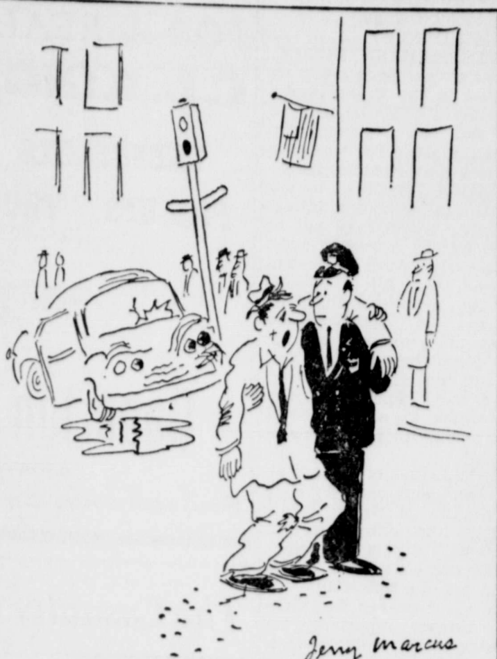
... THEN FOR A MINUTE MY WHOLE LIFE FLASHED BEFORE ME—EXCEPT THE PART WHERE I TOOK DRIVING LESSONS. The Travelers Safety Service

More than 3,500,000 persons were killed or injured in highway accidents in 1963.