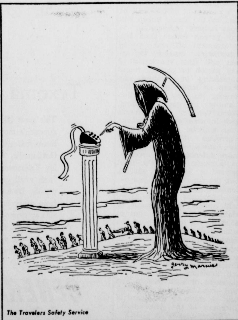
The Travelers Safety Service

42,700 persons died in highway accidents in 1963.