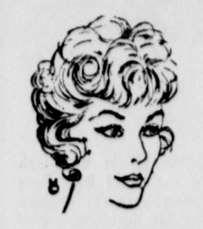
Call 8-4451 for Appointment

items of news-your visits, yeur visitors your parties,