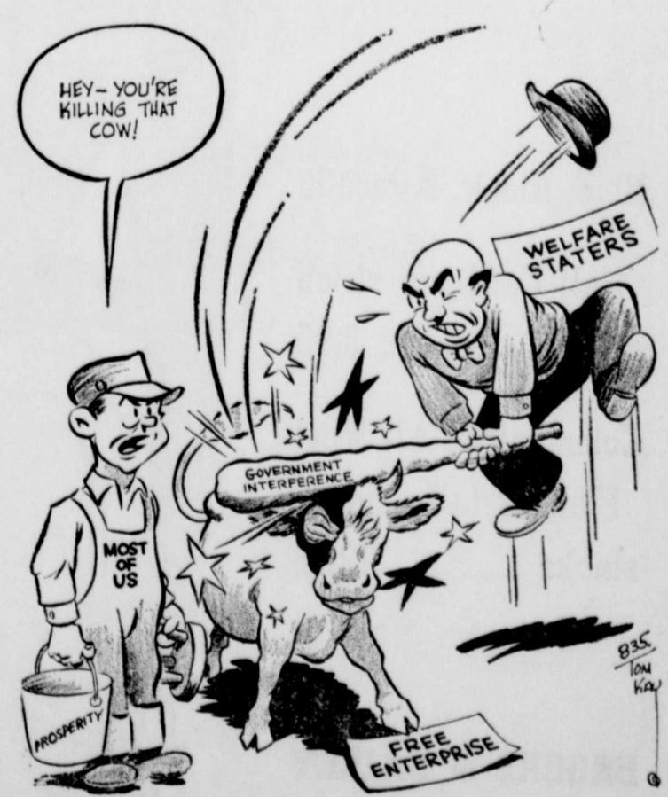
Dead Cows Give No Milk