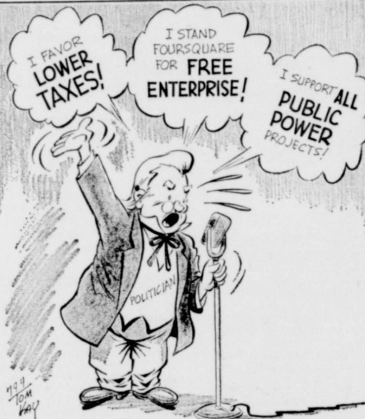
How Inconsistent Can He Be?

The NAVY offers a chance to TRAIN and TRAVEL