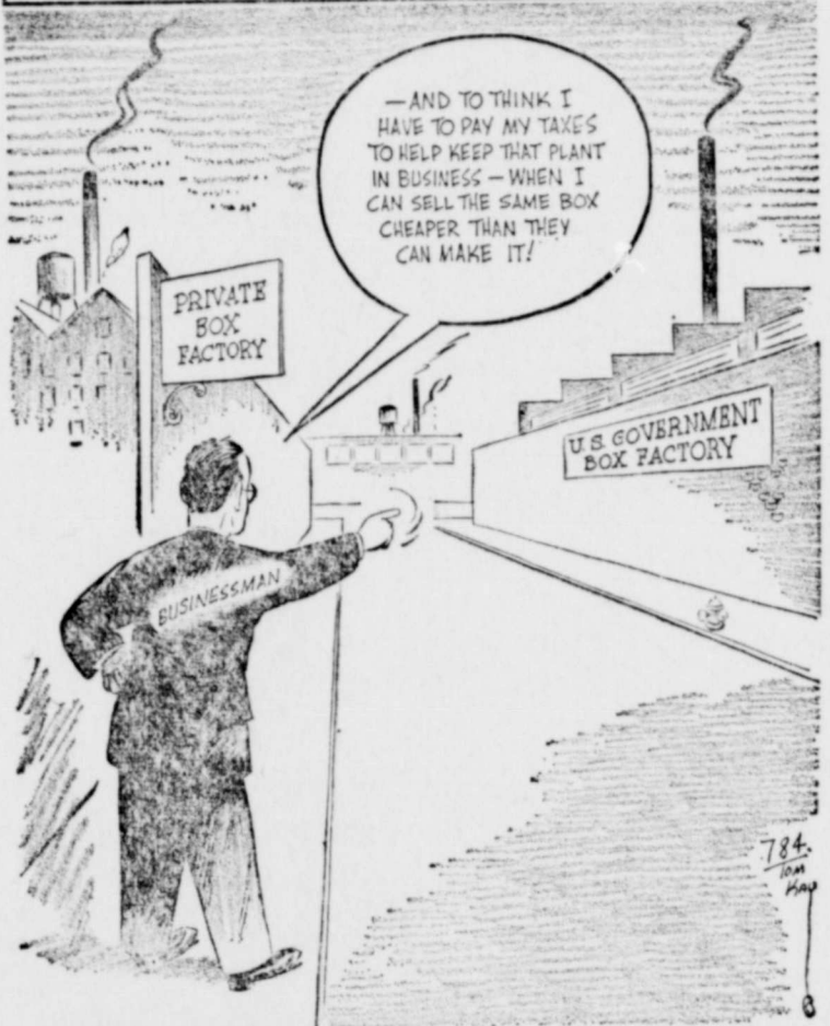
RIDICULOUS, TO PUT IT MILDLY

1960 YOU CAN'T BLOT OUT THE FUTURE! 1970 1980