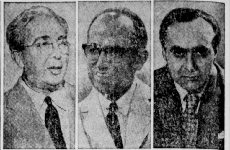
Dr. Szilard Dr. Salk Dr. Bronowski

"Super stars" of science will make up the research team of the Salk Institute for Biological Studies.