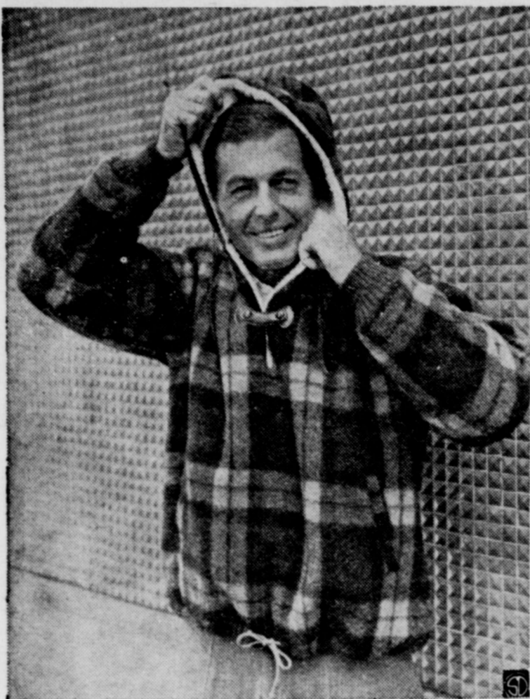
Scotch plaid as colorful as all outdoors is typical of the new bright look in menswear. This winter-warmer is fully lined — hood and all — in soft, luxurious Sherpa pile of Creslan acrylic fiber. The curly-textured pile adds weightless warmth to the smartly tailored pullover jacket by Maine Guide.

Charter No. 9813 Reserve District No. 11 REPORT OF CONDITION OF THE FIRST NATIONAL BANK of Sterling City, in the State of Texas, at the Close of Business on Dec. 30, 1961. Published in Response to Call Made by Comptroller of the Currency, under Section 5211, U. S. Revised Statutes.