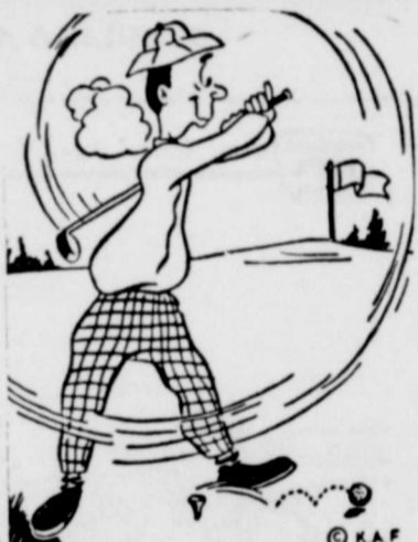
"Fore! Er...that is...3/4"