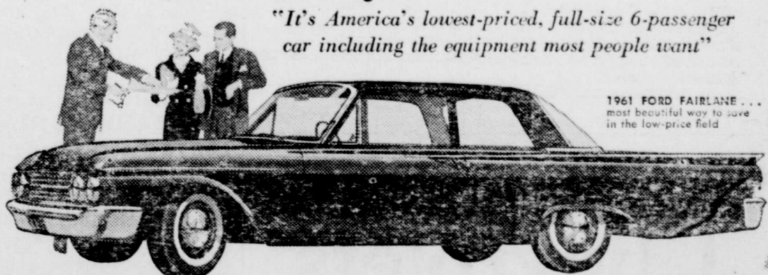
"It's America's lowest-priced, full-size 6-passenger car including the equipment most people want!"

Of all full-size cars only '61 Ford Fairlane saves most and costs least!