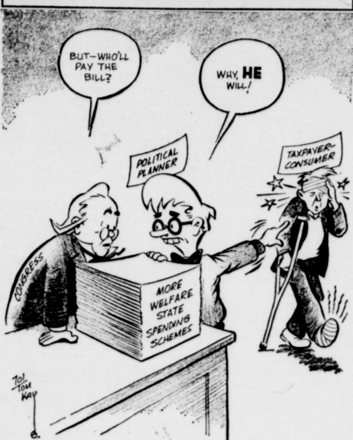
Of Course, Who Else?