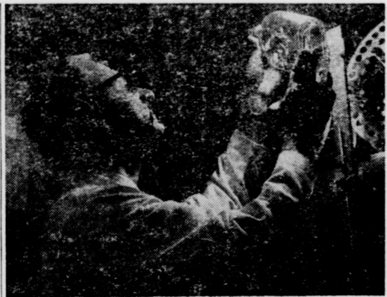
Dr. Albert B. Sabin at his University of Cincinnati laboratory examines samples of his live-virus anti-polio vaccine, developed by him with $1,500,000 in March of Dimes public contributions. Sabin vaccine, to be taken orally instead of by needle, has been approved for eventual use in the U. S.

A great deal of basic research, of this journey into the unknown, was needed to create the bases which made possible the development of the polio vaccines. This again will be necessary as The National Foundation moves forward in its expanded program which includes birth defects and arthritis in addition