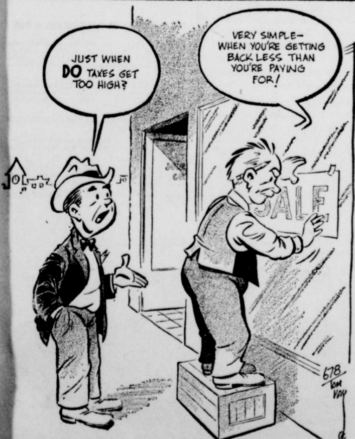
A Logical Answer