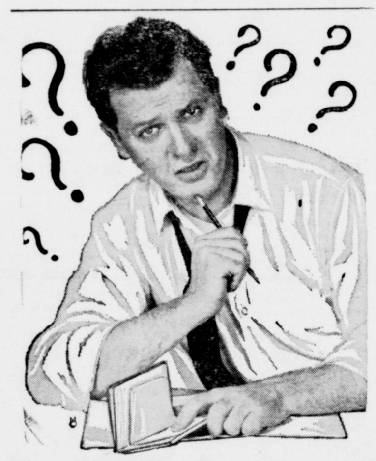
Worried About Your Business?? TRY NEWSPAPER ADVERTISING. All successful businesses make advertising pay off for them.