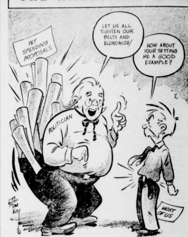
Yes - How About That?