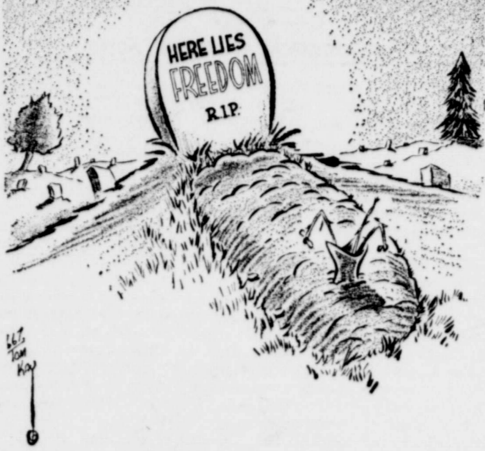
The Fatal Consequence