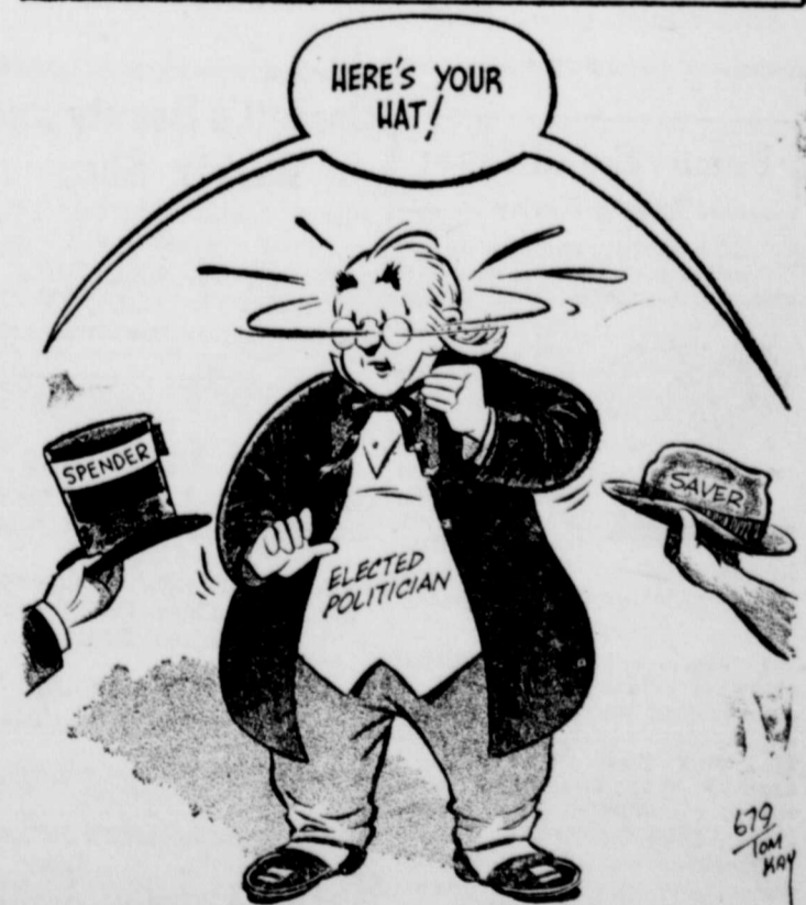
He Can't Wear Both