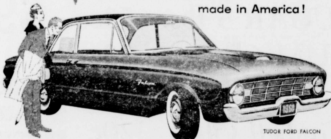
TUDOR FORD FALCON

It's a fact! Ford's advanced engineering makes the Falcon America's lowest-priced 6-passenger car . . . priced up to $124* less than other 6-passenger compact cars. That's not all. There's a quality difference in Falcon's big comfort, big doors, big luggage space! We invite you to fun-test the Falcon today!