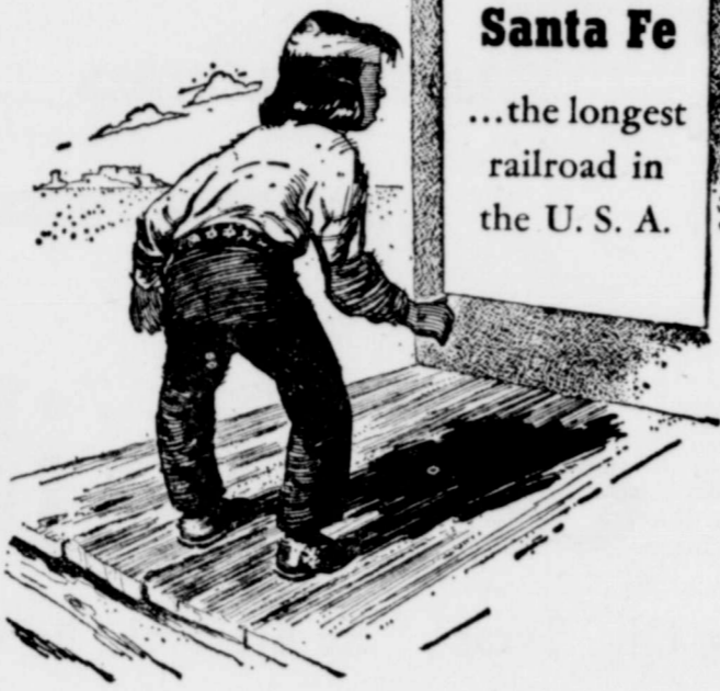
See your nearest Santa Fe agent