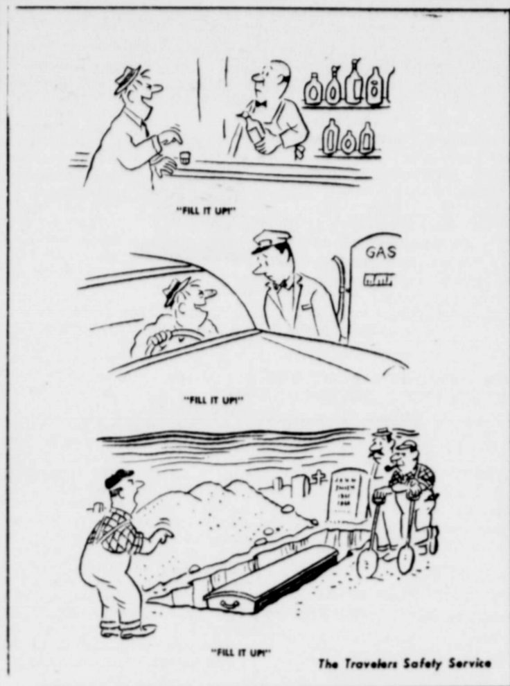
More than 2,900,000 persons were killed or injured in motor vehicle accidents in 1959.