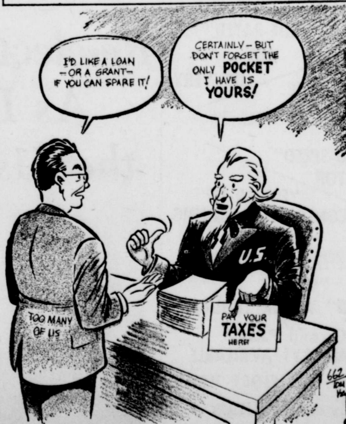
Words of Wisdom