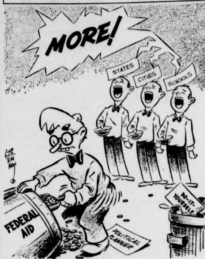
Passing the Buck(s)!