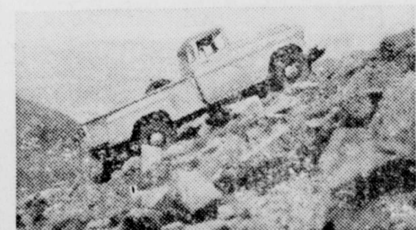
Miles of loose boulders and thinning air offer extreme challenge. Yet the big Chevy engine never faltered; it performed flawlessly mile after mile, all the way up the mountain!