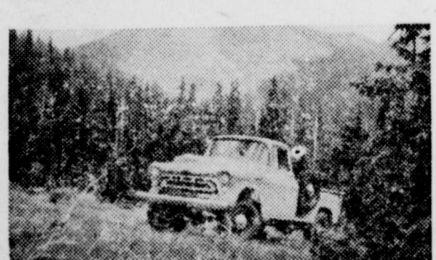
Steep grade near timberline—a rugged test of power. The power and torque of Chevrolet's famous Thriftmaster 6 proved more than a match for the most difficult grades.