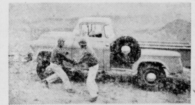
Final effort achieves summit! Pickup conquers Pikes Peak . . . shows why Chevrolet trucks are famous for staying and saving on tough jobs! Talk trucks with your Chevrolet dealer.