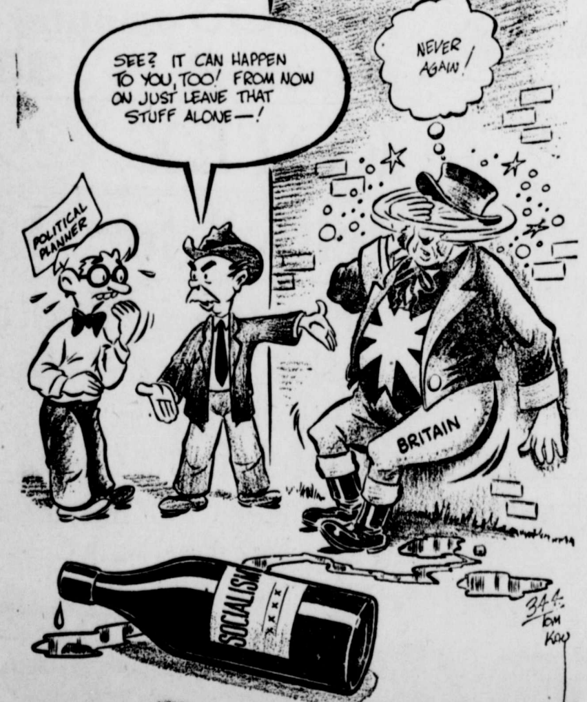
Let's Have No "Morning After" Here