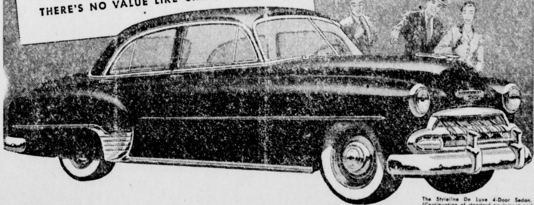
The Strieline De Luxe 4-Door Sedan. (Continuation of standard equipment and trim illustrated is dependent on availability of material.)

Come in... check our prices and these exclusive Chevrolet advantages before you buy! Be Sure You Get the Deal You Deserve! Today's no time to take chances. You want to be certain of top value for your hard-earned dollars. So come in and check the deal we offer you. See how much more you get in Chevrolet... and how much less you need to pay. See us now for the deal you deserve! THERE'S NO VALUE LIKE CHEVROLET VALUE!