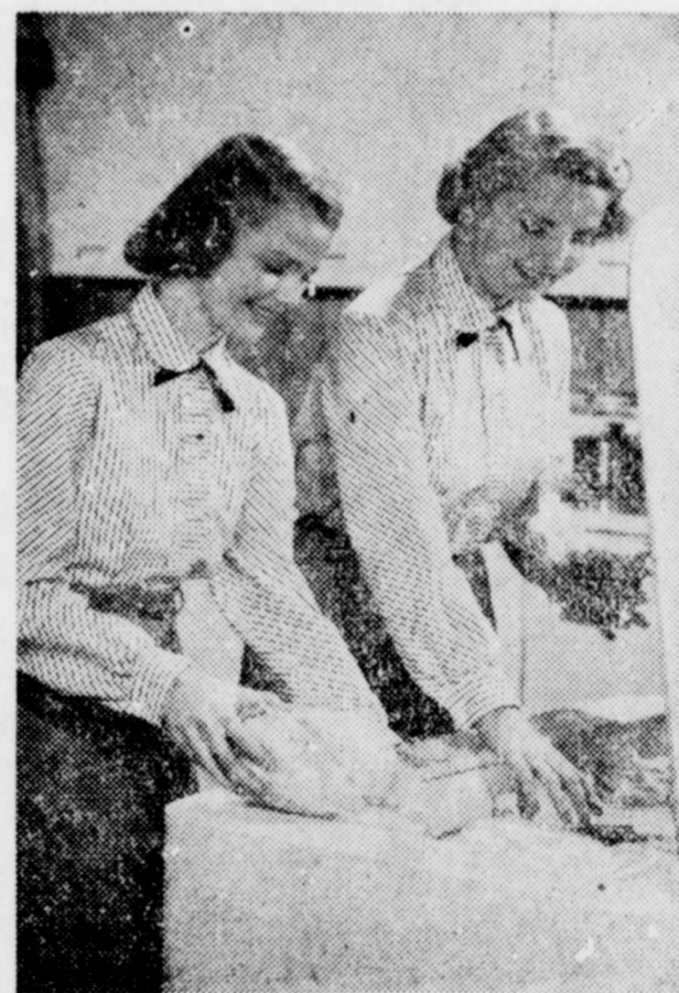
An Electric Freezer saves time and trouble in many different ways, and provides better meals. For the holidays, mince pies, puddings and the like can be baked in advance and frozen. Chill egg tarts, doughnuts and shop tarts can be packed in mealite containers, and frozen for future use.

We Close at 9:00 p.m. through Winter Months