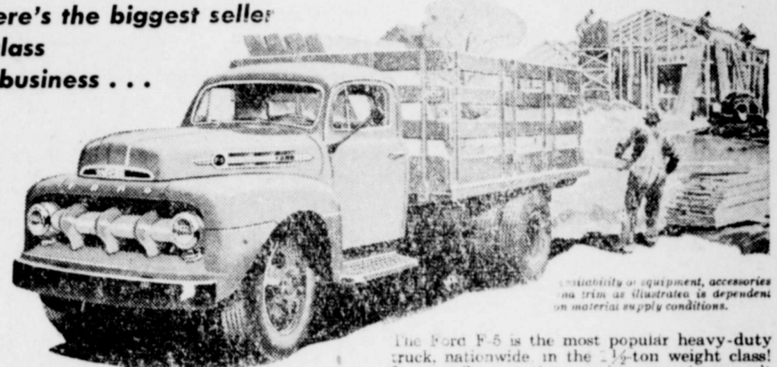
Availability of equipment, accessories and tires as illustrated is dependent on material supply conditions.