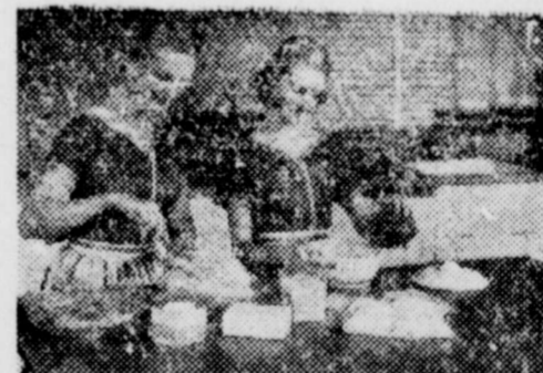
A complete Sunday dinner, prepared weeks in advance and stored in the freezer, is ready to heat and serve when needed. Hamburgers, wieners, and lunches for picnics can be frozen in advance.