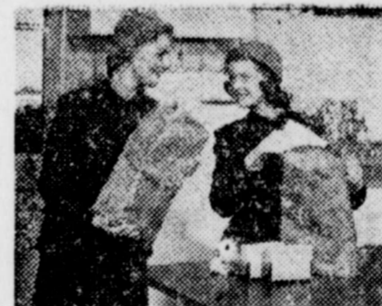
With an Electric Home Freezer you can shop every couple of weeks instead of every day or so. Buy meats, fruits and vegetables when they're on sale, save money that way. You simply freeze and store until needed.