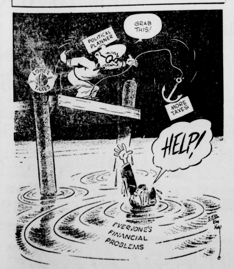
Throwing Out The "Death" Line