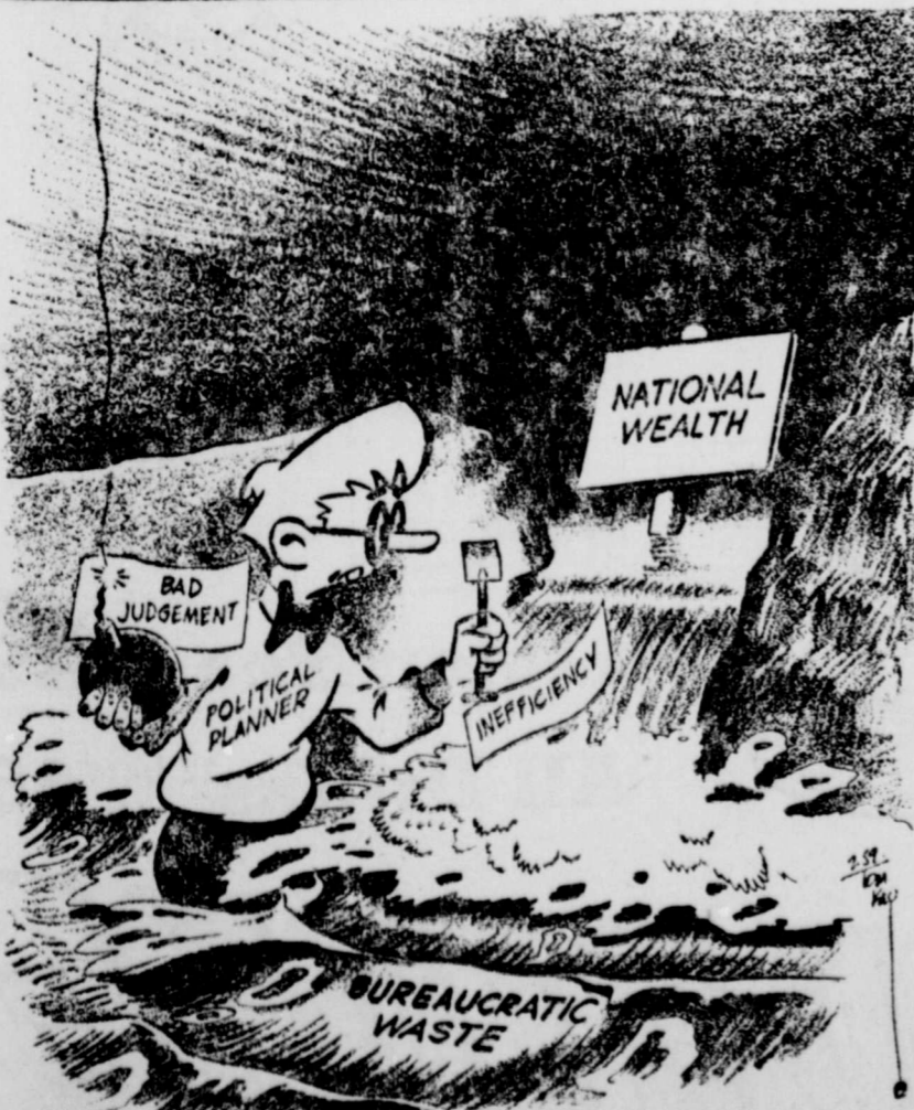
Wrong Tools to Plug That Leak!