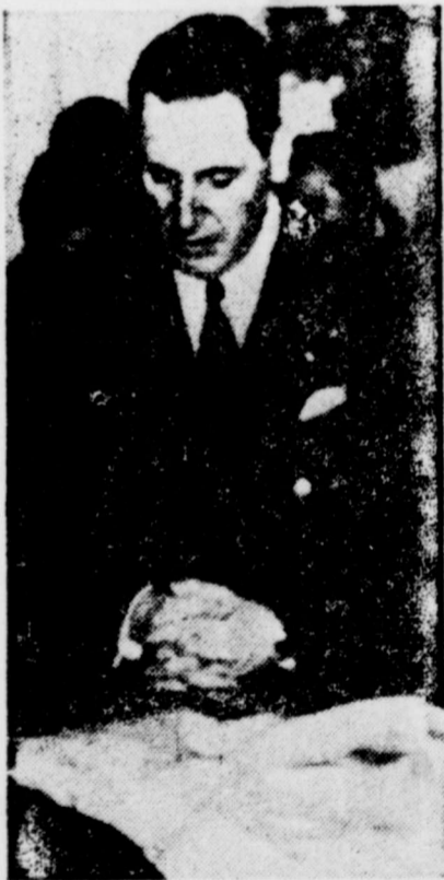
BUENOS AIRES, ARGENTINA—President Juan Peron of Argentina is shown grieving at the bier of his wife, Eva, 33, who died after months of suffering from cancer. Peron was at his wife's bedside during her final hours.

PEACHES are your Best Buy -and Best for You! Select FALMETTO QUEENS Prize Fruit of South Carolina Peach Growers Association