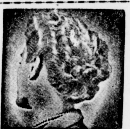
FOR THE LATEST MODES OF HAIR STYLING