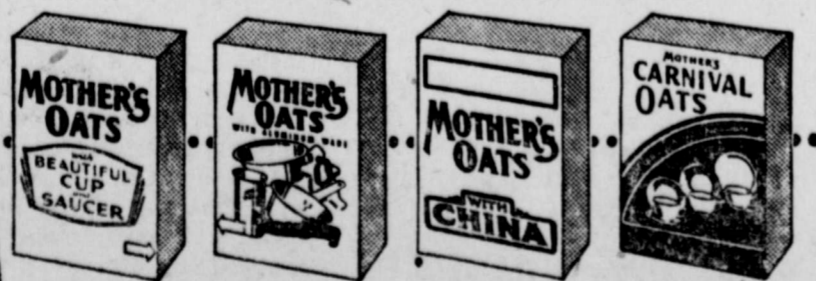
Products of The Quaker Oats Company

Mother's Oats offers you all-purpose selection of DINNERWARE and ALUMINUM KITCHEN UTENSILS