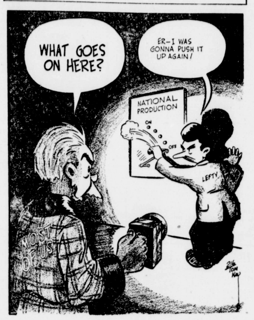
Caught In The Act

Typewriter Paper at The News-Record Shop