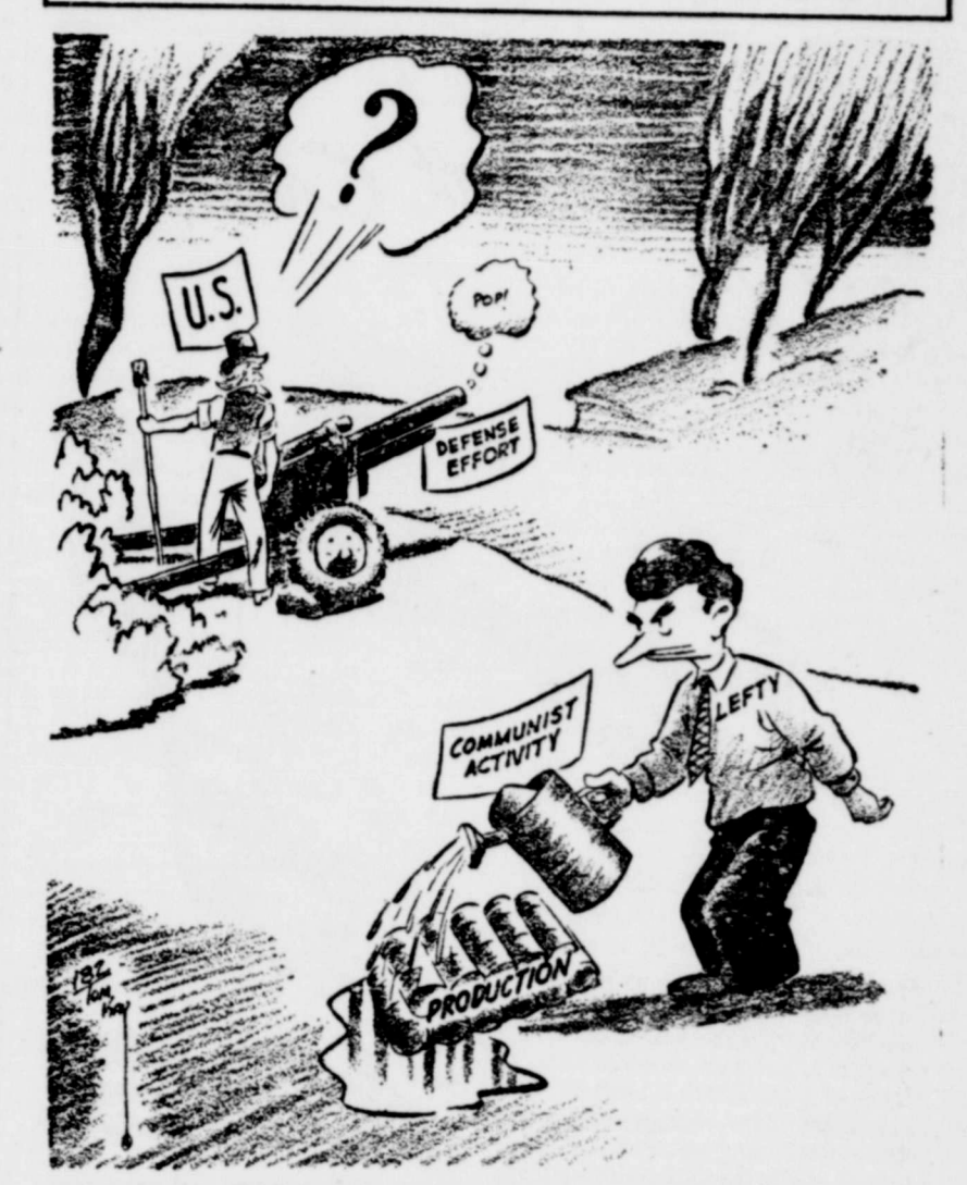
Keeping The Powder Wet