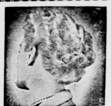
FOR THE LATEST MODES OF

Right now the best guess is that Senate which always lags behind the House on legislation. There is no debate limit in the other chamber and some of the Senators are prone to be long-winded at times. Only last week one energetic Senwithout sitting down.