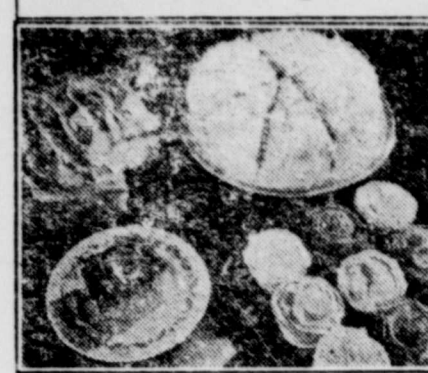
By JANE ASHLEY

Fillings and frostings add appetite appeal to every cake. Corn syrup makes such smooth delicious fillings while frostings are always light and fluffy. For "tops" in flavor and attractiveness, try these delightful corn syrup recipes.