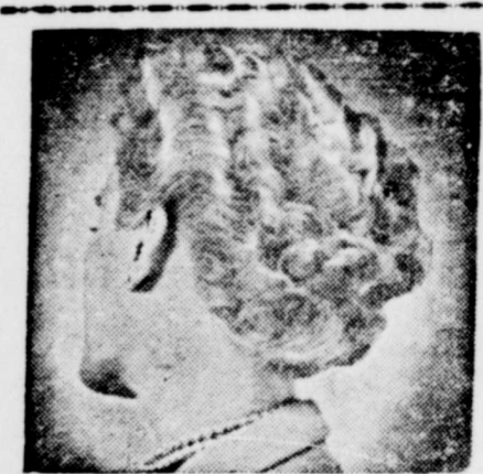
FOR THE LATEST MODES OF HAIR STYLING

For wedding invitations, announcements, at-home cards, etc., set the local News-Record shop.