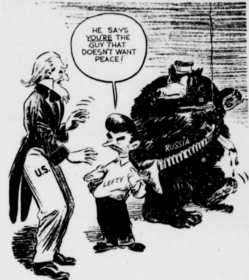
Look Who's Talking!