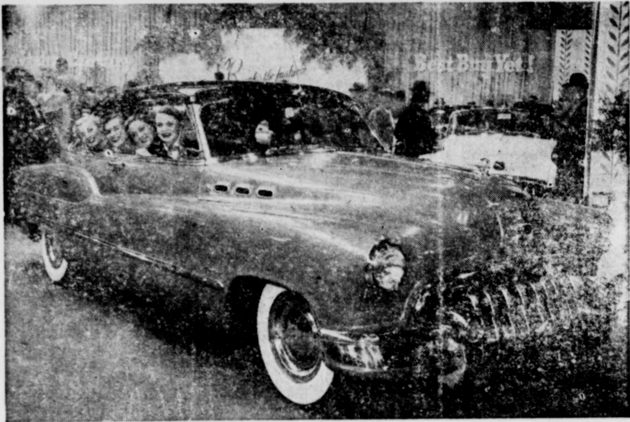
CHICAGO, ILLINOIS — Four beauty queens and a car being shown publicly for the first time — Buick's Riviera in the Super Series — were outstanding hits at Chicago's huge automobile show. More than 400,000 visitors jammed the International Amphitheater for the show, which was the first event of its kind in Chicago since 1940. The four smiling beauty queens posed in the Riviera to illustrate one of its principle features — the broad sweep of vision equivalent to that of a convertible. The car, however, has an all-steel top. Other features which interested visitors were the wide rear window, the built-in bumper front end, one-piece windshield, the sloping fender lines, and the new F-263 engine.