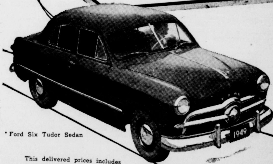
* Ford Six Tudor Sedan

... That the price of a '49 FORD $1,545.00 Tudor Sedan is only DELIVERED IN STERLING CITY