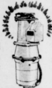
MODEL FA-3ER DISPOSALL

The electrically operated Disposall shreds all food waste—including bones—into fine particles, which are carried down the drain and out of the house—immediately. Your sink is always clean!