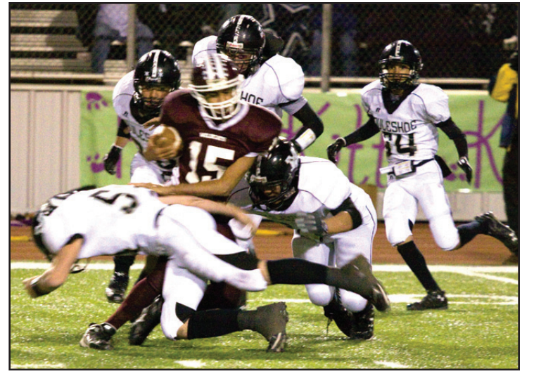
Muleshoe versus Littlefield