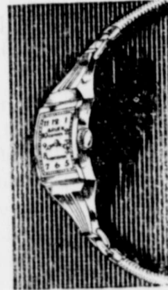
Curvex Crescent $59.50