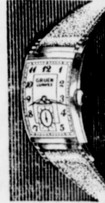
Curvex Knight $67.50