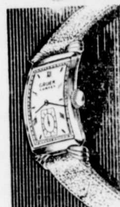
Curvex Collegian $55.00

Only Gruen can give you the famous Curvex model wrist watch with the famous curved movement and case that conforms to the wrist.