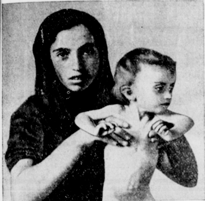
A YUGOSLAV MOTHER holds her baby which she has managed to keep alive by feeding it her own meager ration. Both are typical of millions suffering from acute malnutrition in Europe and Asia who will die unless more food is provided immediately. You can help by giving money or canned food to the Emergency Food Collection.