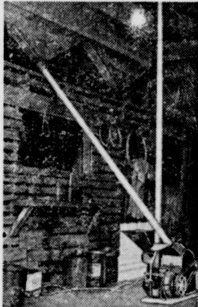
FEED GRINDING JOB —taken over by 3 horsepower motor; overhead bins and gravity-flow chutes make the job practically automatic.

Tests show that small mills can grind 100 pounds of grain at a cost