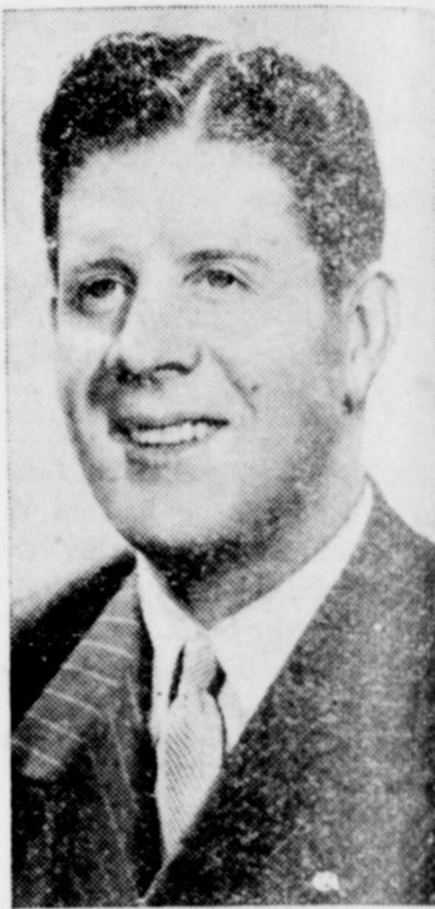
RUDY RESUMES - Rudy Vallee will continue as singing host of the lively "Drene Show" when it returns to NBC on Aug. 30 after its summer vacation.