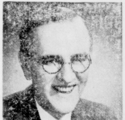
"But my Gulf man is helping me to keep my old car running. With Gulfpride* and Gulflex**, he says it should last until I get a new one."