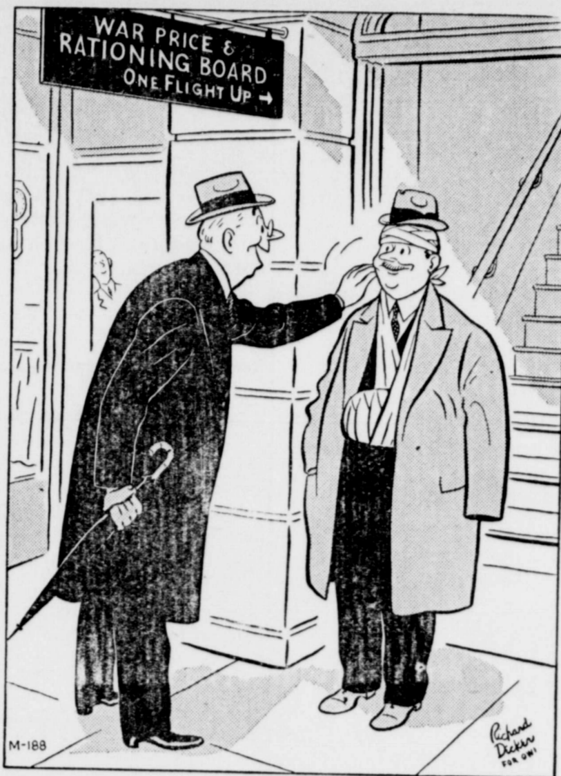
"CONGRATULATIONS, GEORGE, ON YOUR THREE YEARS WITH THE RATION BOARD. I CAN SEE THAT YOU STILL PLAY NO FAVORITES."