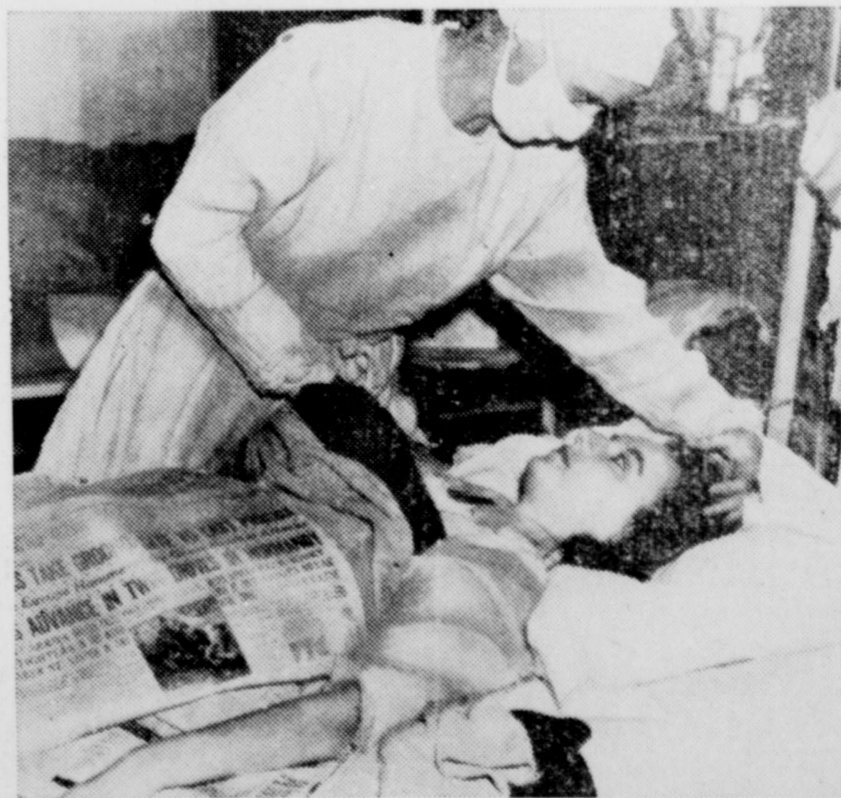
The eighteen-year-old daughter of a general overseas with the American invasion forces fights infantile paralysis in North Carolina. Her nurse is her mother, who volunteered for the duration of the epidemic emergency at the Hickory Emergency Infantile Paralysis Hospital, when the daughter was stricken.

Attend the Sock Supper at the Gym Tuesday Night